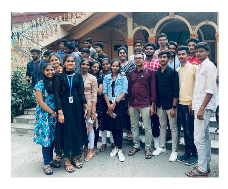
Students & Faculty of NNRG at Ramakrishna Math